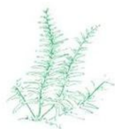
Crane Hollow Preserve