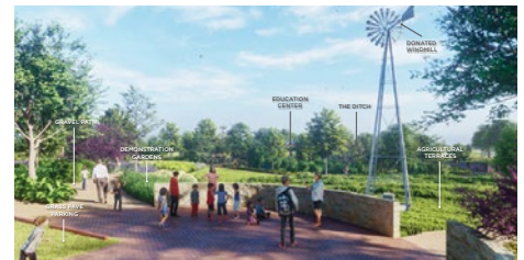
THE DIDACTIC DITCH - STEPHENVILLE, TEXAS Promoting Conservation Through Demonstration

Landscape Architecture and Master Planning 214.954.7160 www.studiooutside.us