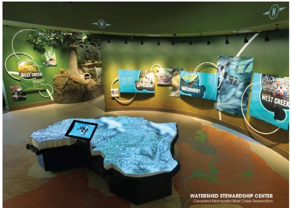
WATERSHED STEWARDSHIP CENTER Cleveland Metroparks West Creek Reservation

SW: The ANCA summit was the perfect primer for Lower Phalen Creek Project ahead of the organization's 2023 opening of the Wakáŋ Tipi Center. With construction slated to begin in October 2021, curriculum and exhibit development, user guides, accessibility, and a range of organizational infrastructure considerations are all at the top of the list. In specific sessions, breakout rooms, and even in learning more about other ANCA member organizations via the Padlet hubs, I gleaned so much valuable information — content to model, words of wisdom, and the strength of a growing network! 🌱