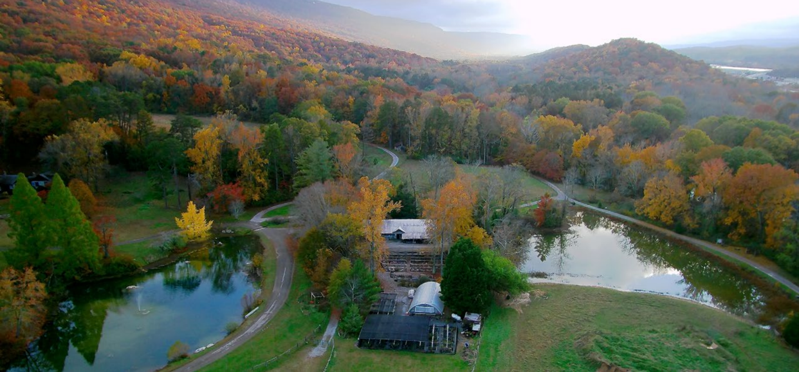
Above and below: fall scenery at Reflection Riding.