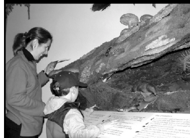
exhibit design and fabrication for displays small or large

978.544.1900 www.holbekgroup.com 18 Chase Court, Orange MA 01364