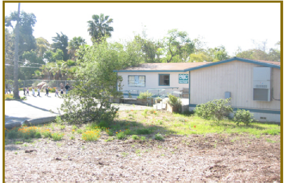
The Environmental Nature Center received a $4.5 million gift from the Harry and Grace Steele Foundation. The funds will be used to replade the existing modular building with a new sustainably designed interpretive center.

made to the ENC was because she valued the Center's influence on the children of our community and she was very concerned about something she