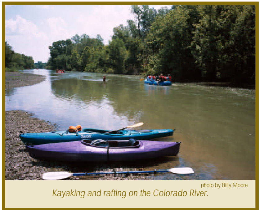
Kayaking and rafting on the Colorado River.