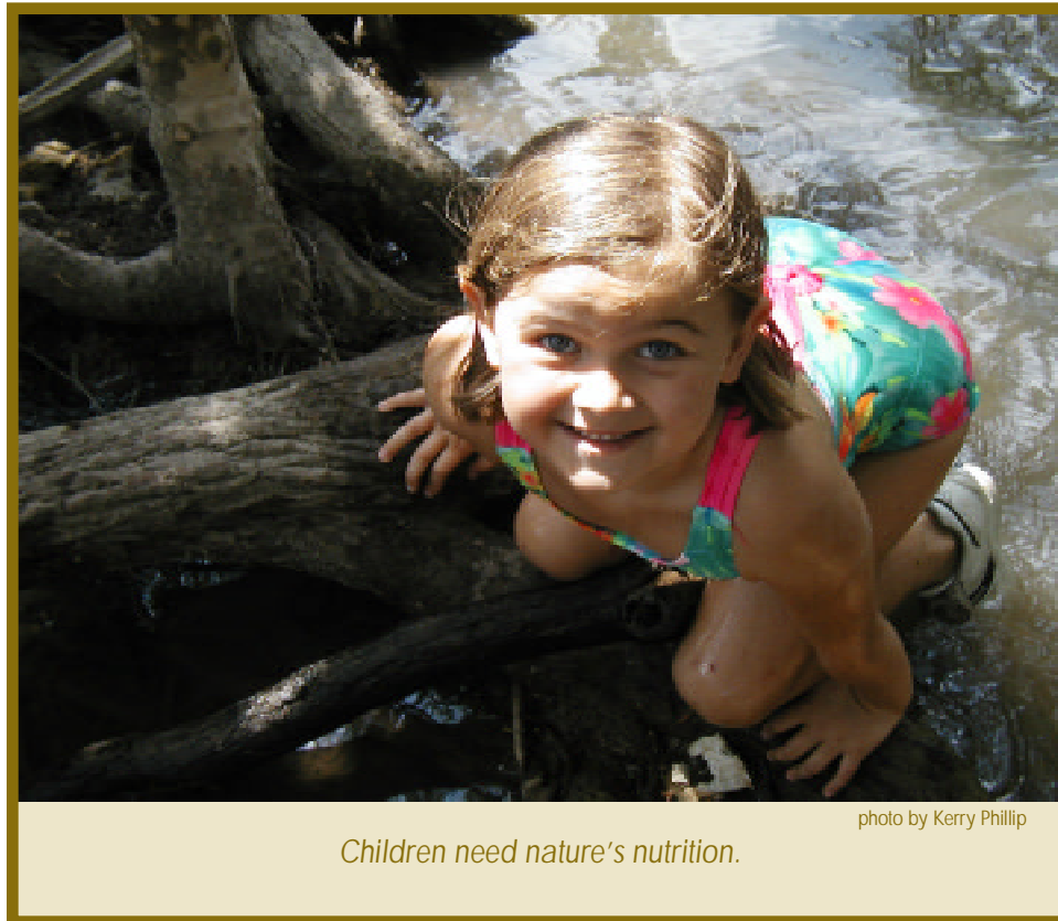
Children need nature's nutrition.

Nature centers shine by inspiring good local stewardship. Talented interpreters can engage their audiences, ask challenging questions, and make conservation fun. This is how top-notch interpretation differs from informing. At its best, interpretation provokes. Interpretation can arouse action. Interpretation can promote care for the land and the children.