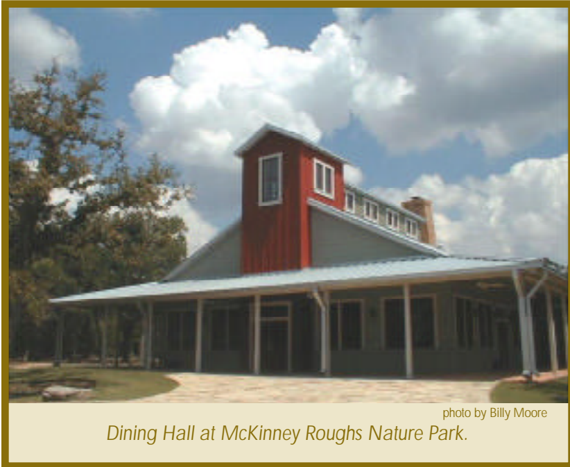
Dining Hall at McKinney Roughs Nature Park.